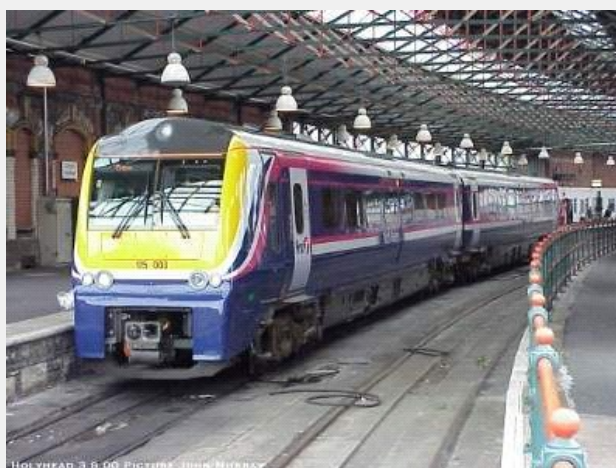
HOLYHEAD 3.5.00

175 008 seems to have a history of 'firsts' - it was also the first to catch fire and spend some months being repaired - as it was the first to receive a name (since removed): it was named Valhalla (after the big ride at Blackpool) on 2 November 2000. The name was chosen in a First North Western/Asda competition and was submitted by 11-year-old Adam Cotton. (Earlier public competitions for names seemed to fizzle out.) This name was carried on the white stripe of the FNW livery; later ones done under FNW were a rather tacky vinyl pseudo-nameplate. The only Arriva naming so far, 175 003, had a different style looking more like a real nameplate, but Arriva have removed all the names during repainting their livery.