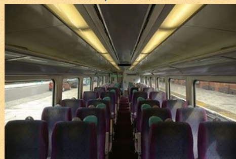
Standard Class interior of 175115 at Llandudno in 2009.