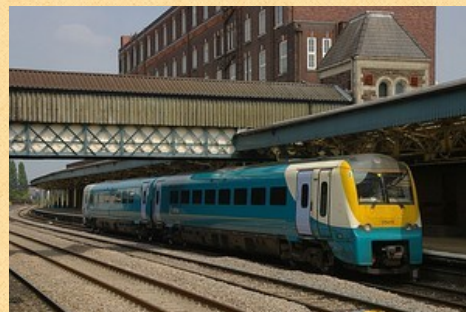
175011 operating an Arriva Trains Wales service at Newport in 2009.